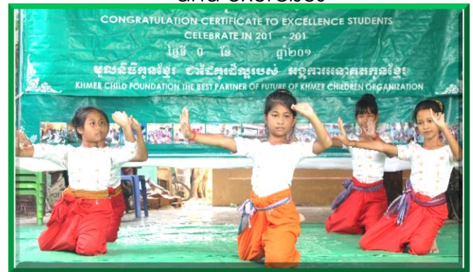
Students perform a dance for guests at the graduation ceremony