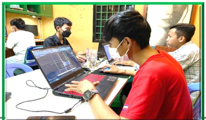
Design students are studying carefully