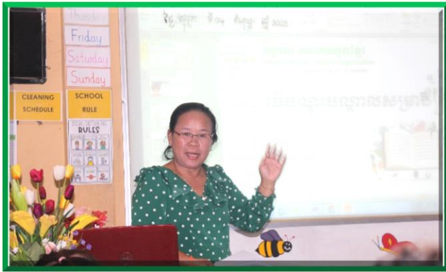
The principal of F.K.C teaches life skills to parents of students