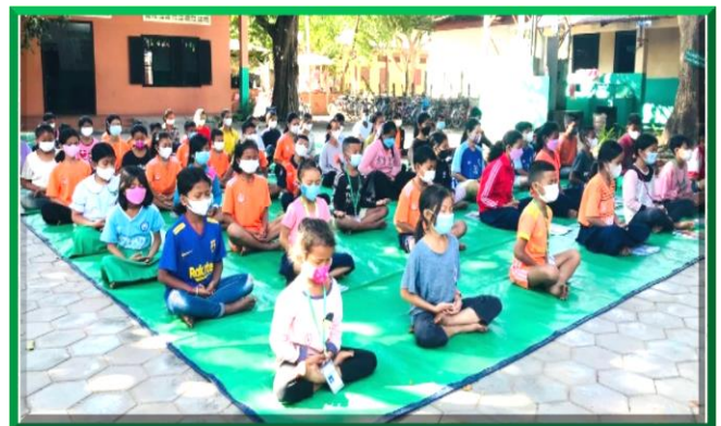
Students meditate at Nokor Krao Community School