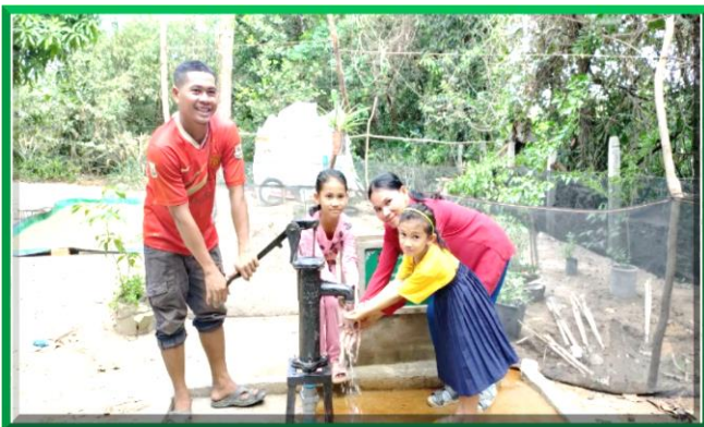
Poor Families received Well