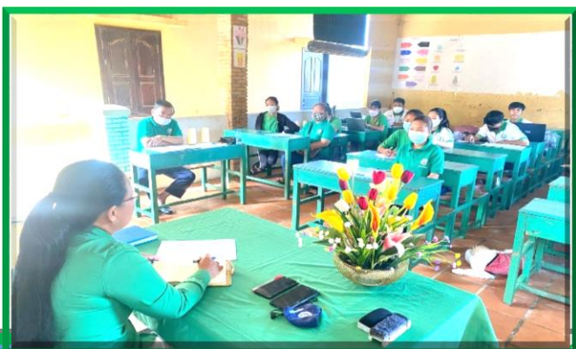
Monthly Meeting of Future of Khmer