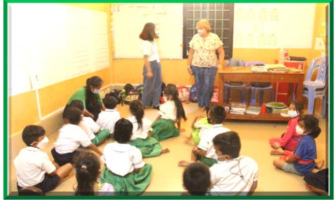
Student activities playing games with volunteer guests