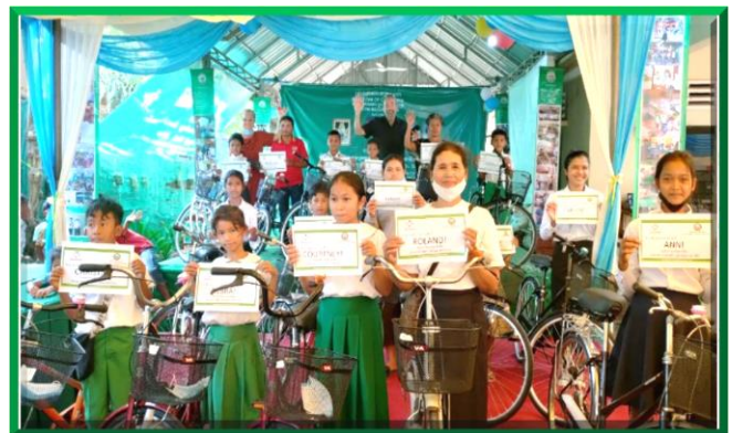
Poor students receive bicycle from F.K.C and donors