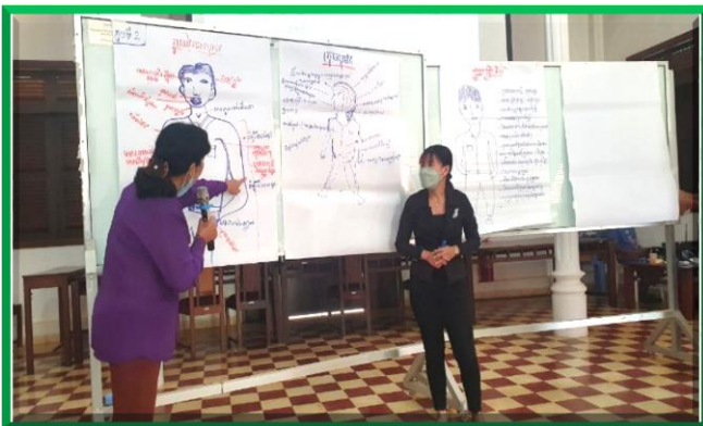
Two F.K.C teachers attended Gender Workshop