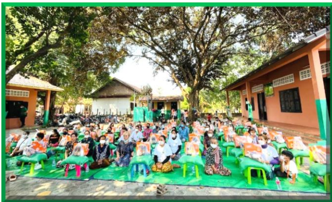
Poor Families in Nokor Krao Village Receive Food support