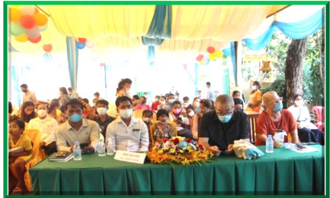
Participation in the graduation ceremony for students