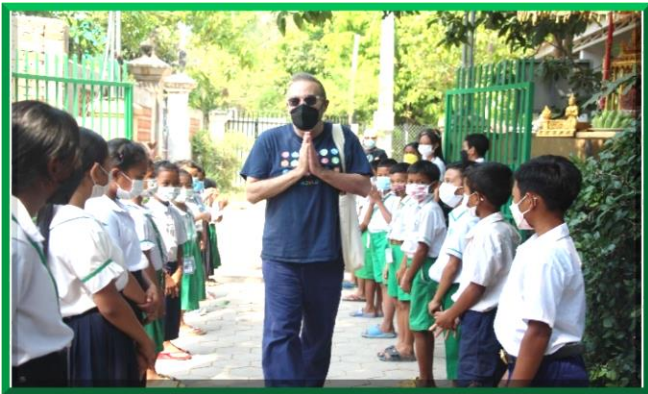
Welcomed donors come to see F.K.C