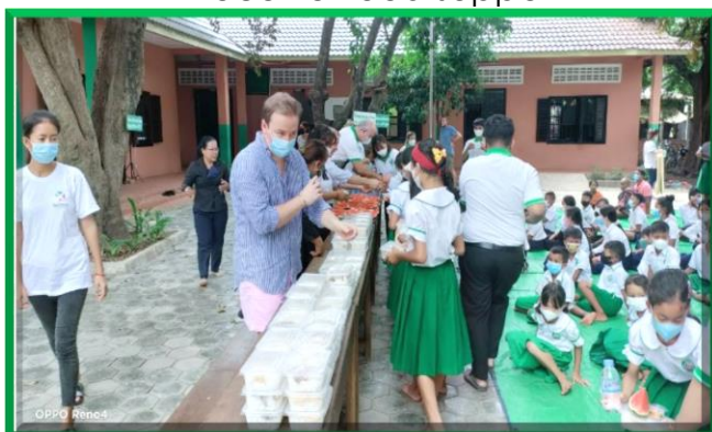
Food distribution activities for students at community school