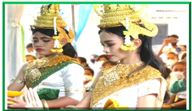
Student traditional dance performance at the graduation ceremony