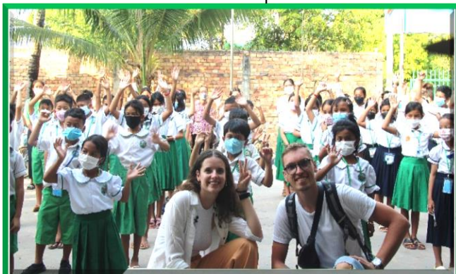
Taking photos as a souvenir of students and guests visiting F.K.C