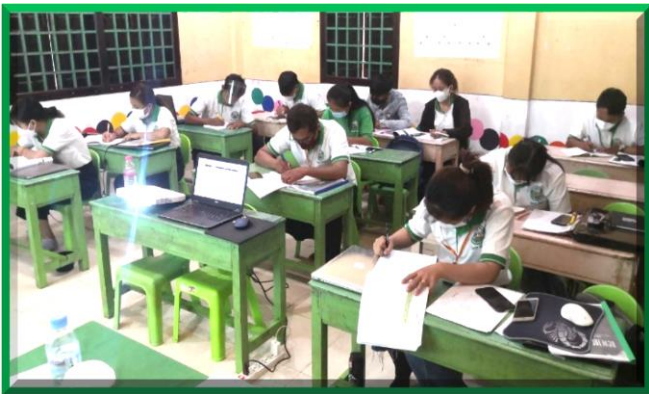
Teacher study English with American teacher