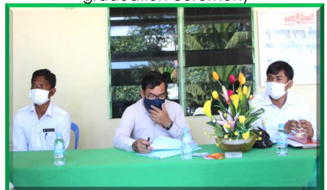
Inspection team of the Department of Education, Youth and Sports of Siem Reap Province observe F.K.C school