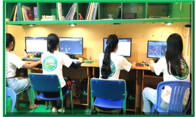
Design students doing homework and exercises