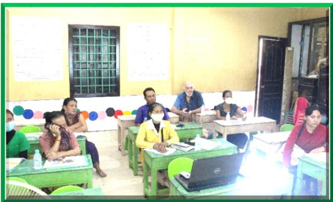
Informing parents, guardians' students about life skills