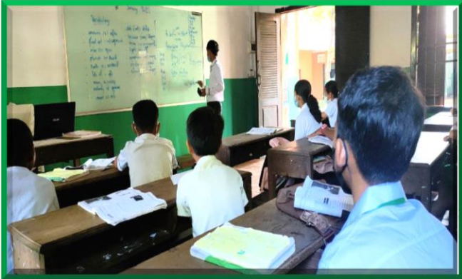
Students learn English diligently