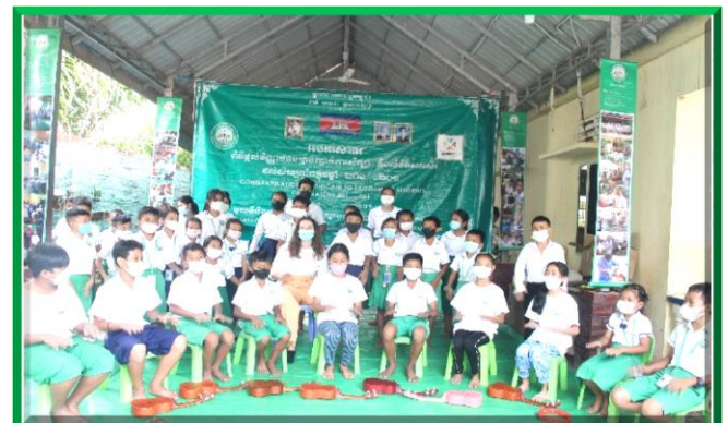
Music students perform for guests at graduation ceremony