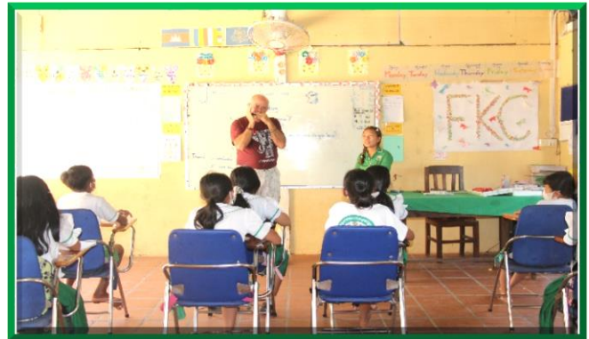
French guests teach music to students