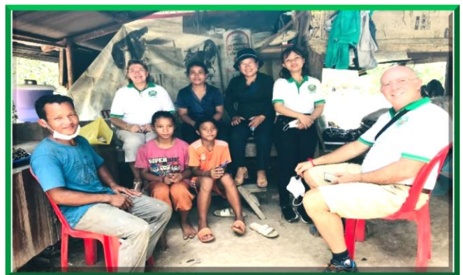
F.K.C staff and guests visit poor families